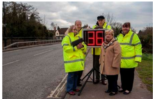
Community SpeedWatch volunteers