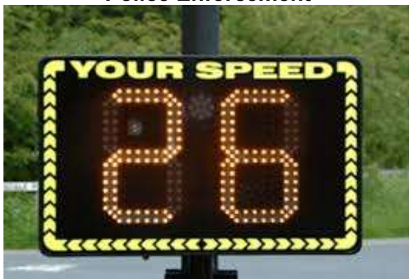
Parish/Town Council purchased SID