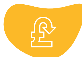
keeping council tax as low as possible