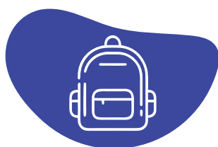
school places and travel