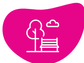
parks and open spaces