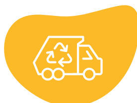
waste collection and disposal