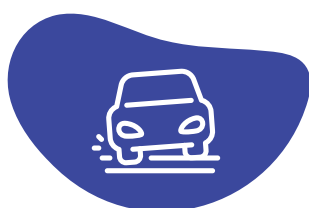
fixing and cleaning roads