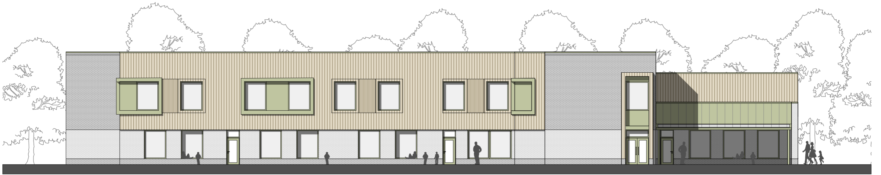
South Elevation | NTS