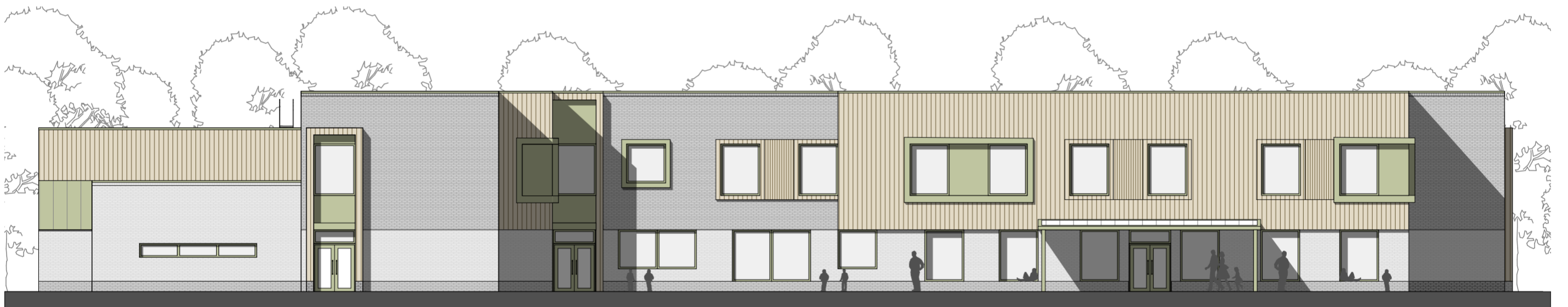
West Elevation | NTS