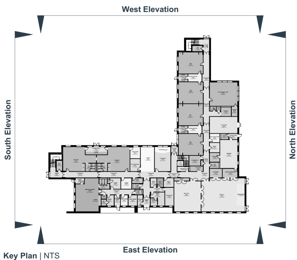
Key Plan | NTS