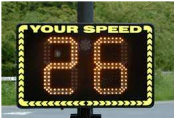
Parish/Town Council purchased SID