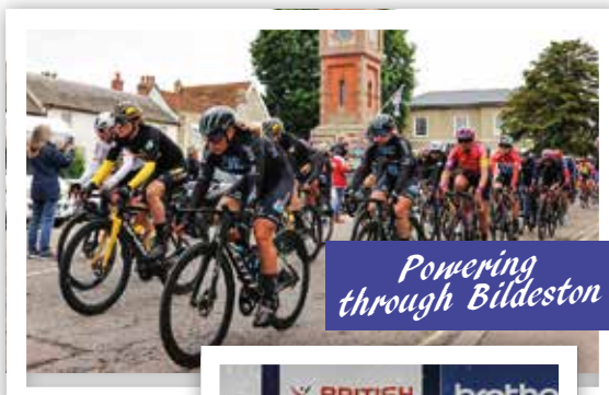
Powering through Bildeston