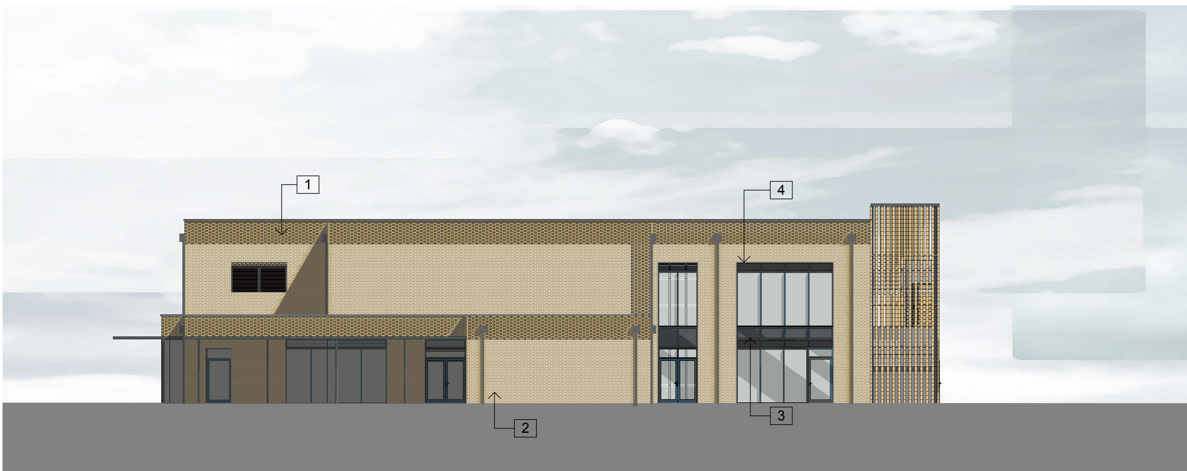
Proposed Southern Elevation