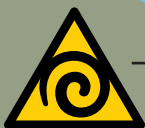
Beware strong rip currents