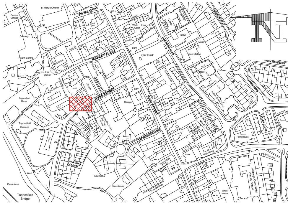
LOCATION OF WORKS LOCATION PLAN N.T.S