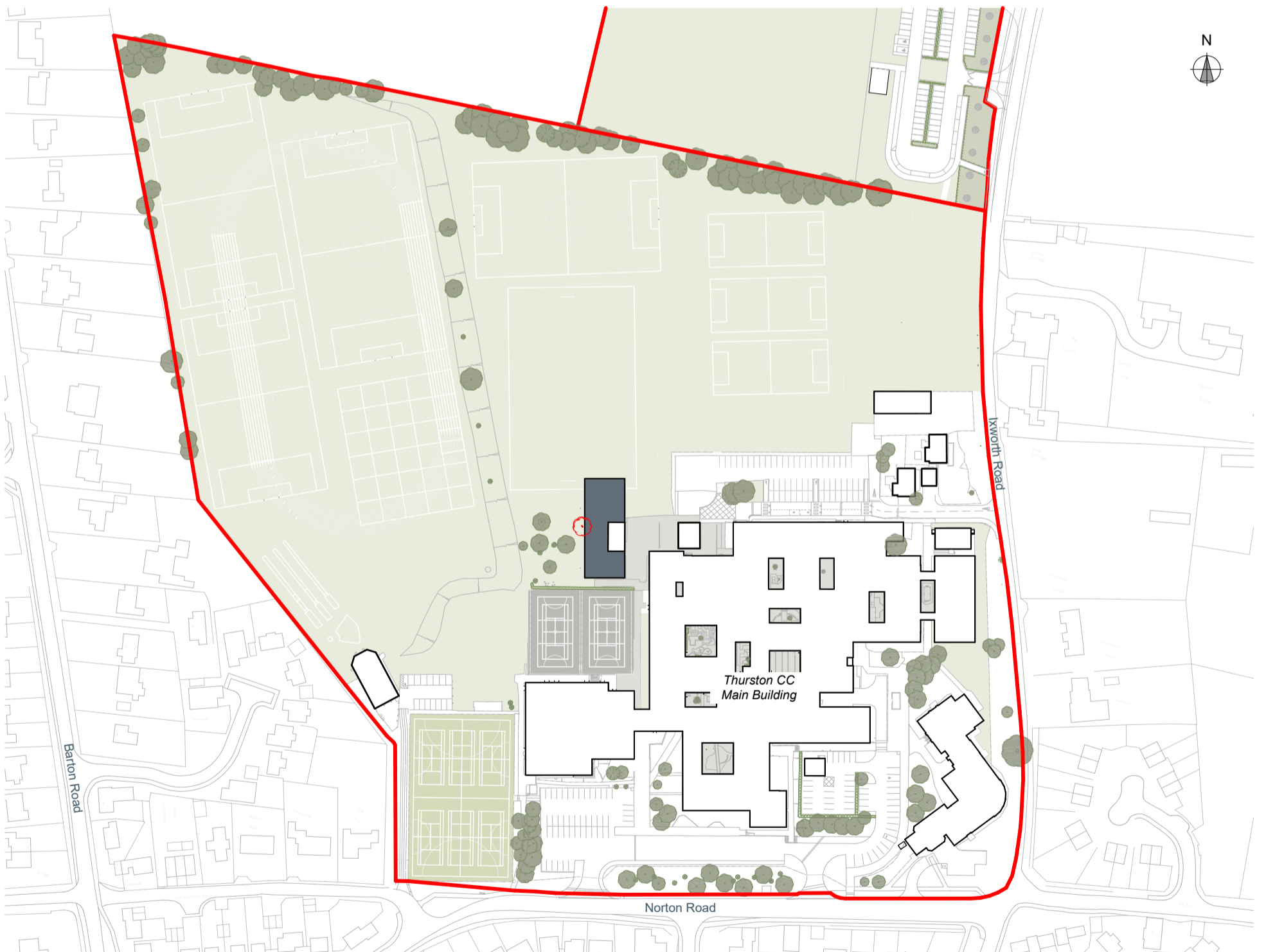
Above: Concept Site Masterplan