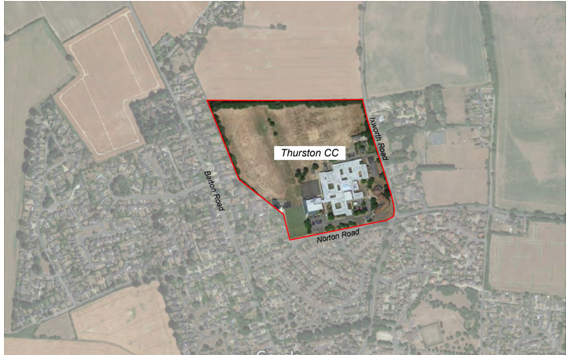
Above: Location Plan

If possible please comment online at www.suffolk.gov.uk/consultations or via email to schools@suffolk.gov.uk . Completed paper comment forms must be returned to TCC Consultation, Schools Infrastructure Team, Suffolk County Council, Endeavour House, 8 Russell Road, Ipswich IP1 2BX. All comments must be received by Friday 16th July 2021 .