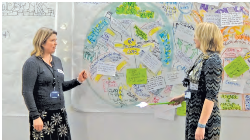
When in doubt talk it through with someone experienced in the use of these processes.

All these processes provide ways for skilled person centred practitioners to engage with issues around inclusion, disability, challenging behaviour and exclusion.