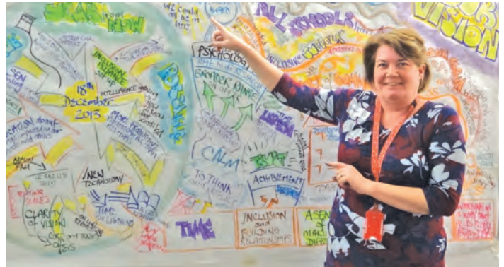
At heart they are tools for inclusion.

use support services, when used imaginatively by people with a commitment to person centredness and inclusion. Used well, with enthusiasm and commitment, these tools can be an excellent way of planning with people of all ages who might otherwise find it difficult to plan their lives, or who find that other people (and services) are planning their lives for them.