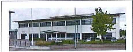
The Coroner's Service

Beacon House, Whitehouse Road, Ipswich, Suffolk IP1 5PB