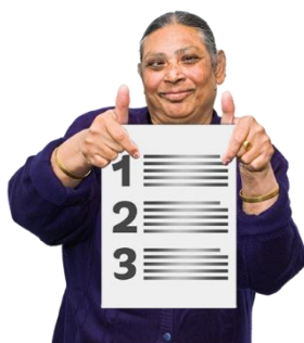
What are the proposals