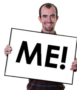
What this would mean for you