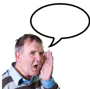
What you have told us