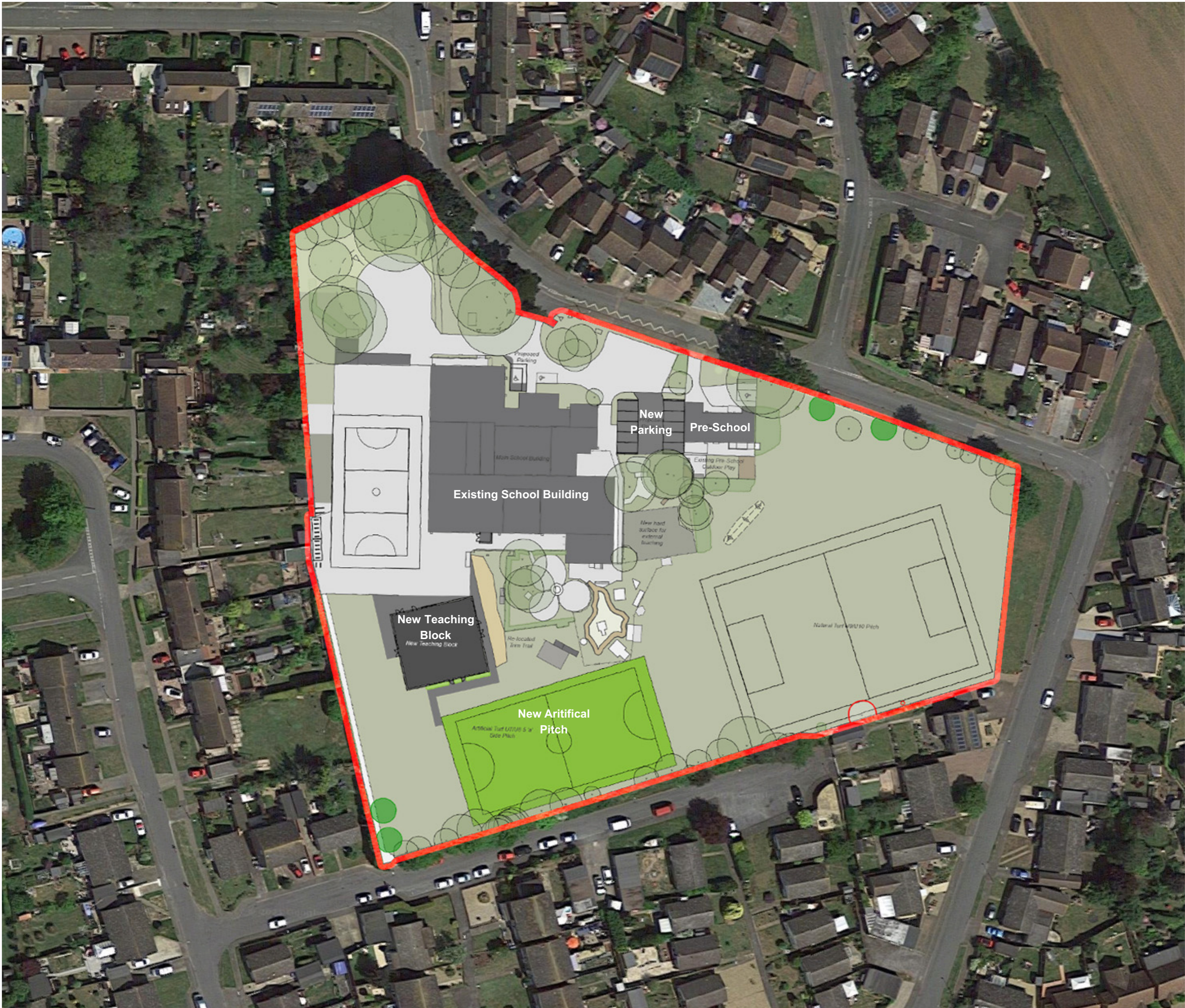
Concept Site Masterplan