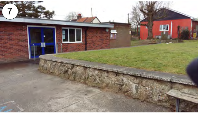
Existing low wall to be removed and area modified to enable new phase 2 building, improve circulation space with outdoor learning area