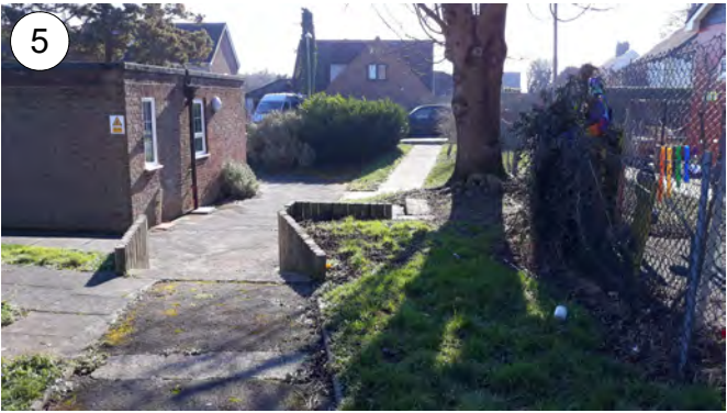
New formalised entry for duckamere