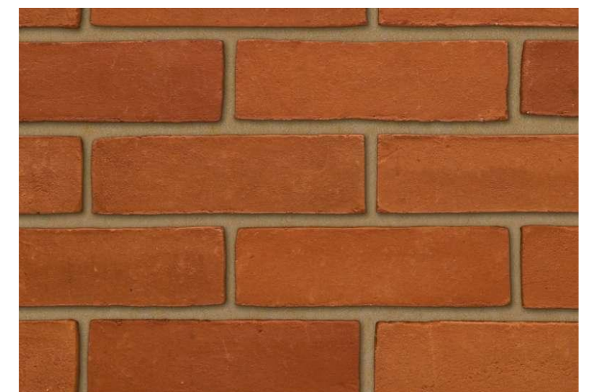
Red Clay Brickwork