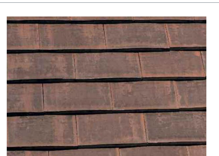
Clay Plain Roof Tiles