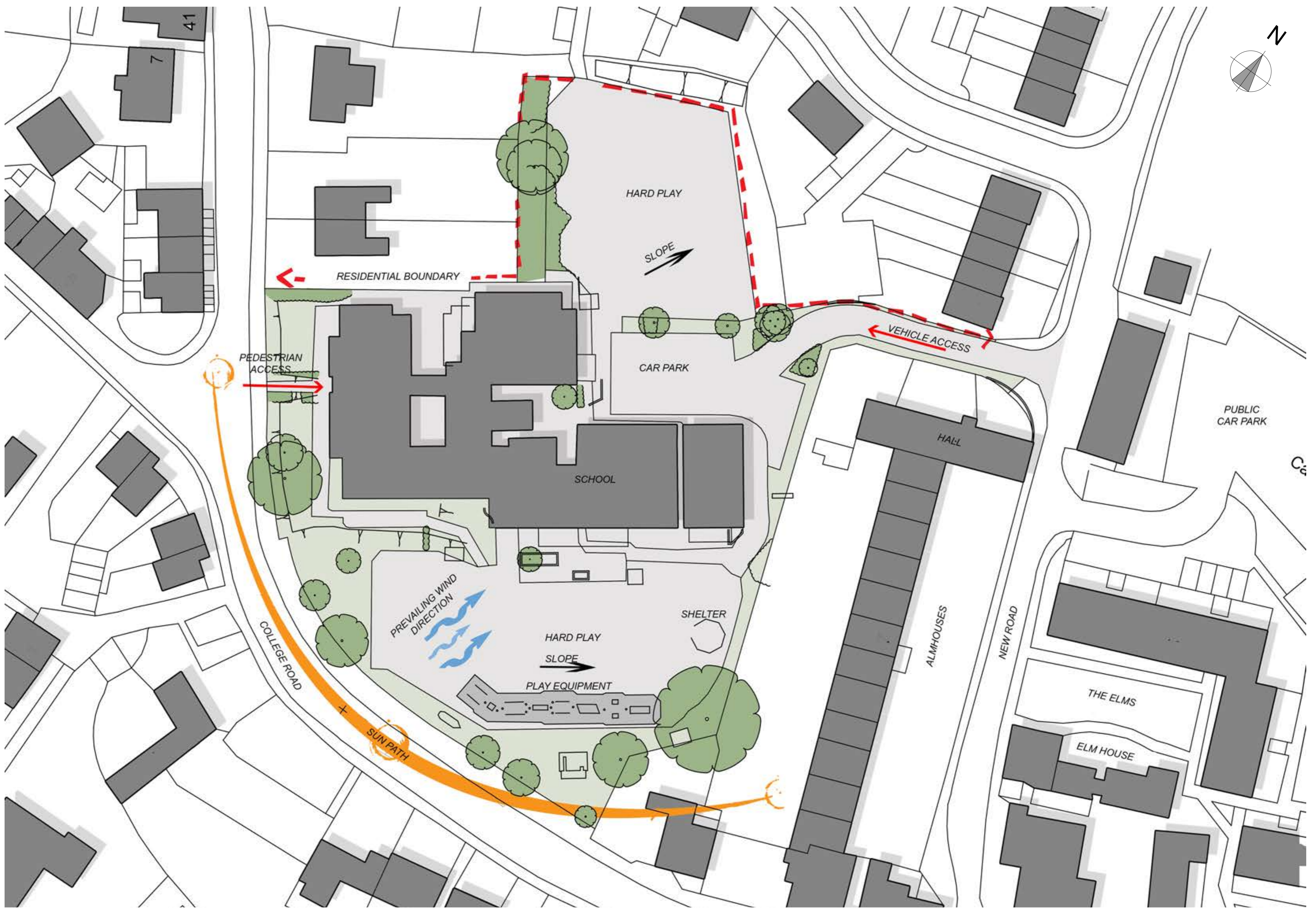
Existing Site Analysis