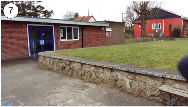
Existing low wall to be removed and area modified to enable new phase 2 building, improve circulation space with outdoor learning area