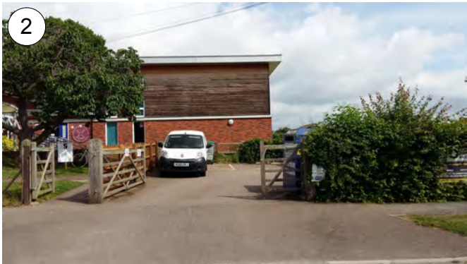
Existing car park modified to accommodate accessible car parking spaces and bin storage