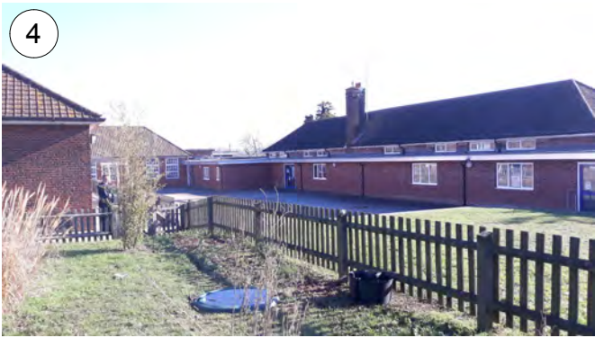
Location for new phase 1 and 2 building