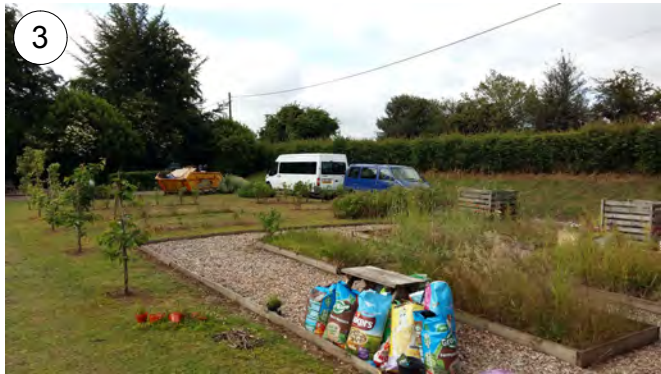
Indicative location for phase 1 car park