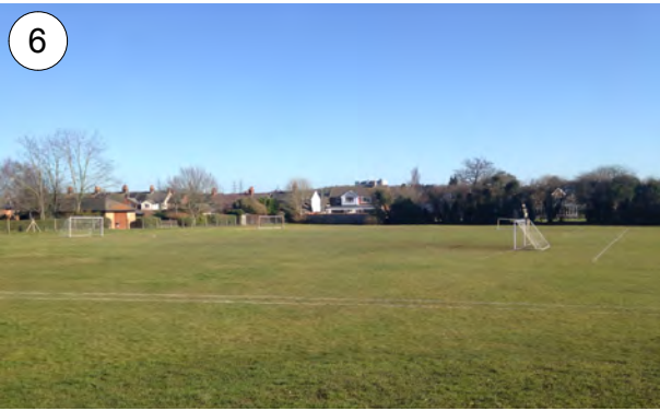
Existing sports pitches retained