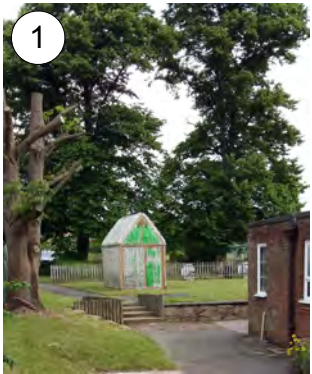
Retain existing trees