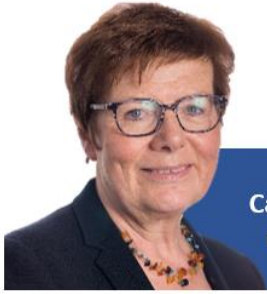
Cabinet Member for Children's Services