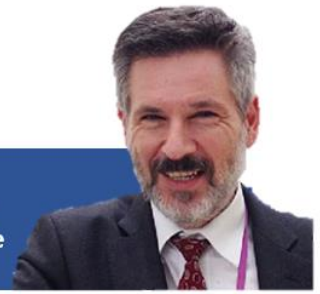
Corporate Director for Children & Young People