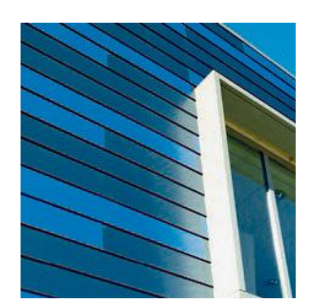
Blue cladding to classbase's

Engineering brick plinth to extensions and facing brick on office and admin areas of the proposed extension, brickwork to match existing school building.