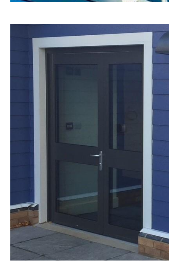
Aluminium doors and windows

To new classbase extension, to display the schools colours and continued vibrancy added to the site.