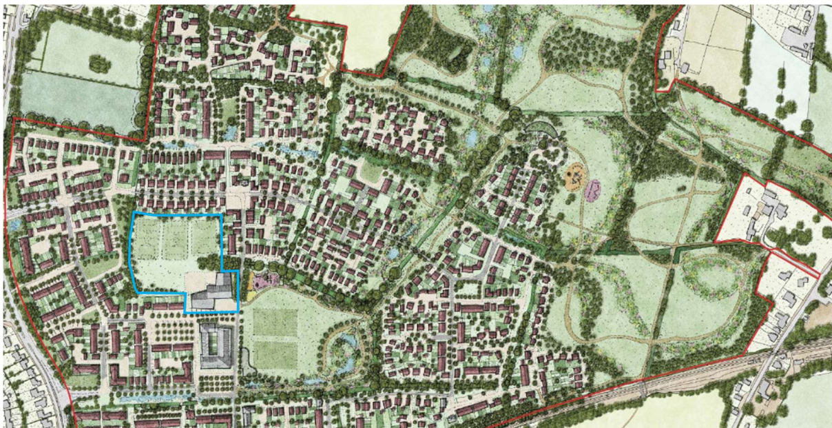
Figure 3 - School location identified on the above plan, from Crest Nicholson's Henley Gate Neighbourhood website https://www.henleygate.co.uk/about/

A site of no less than 2Ha is included in a S106 agreement. Indicative plans for the new school follow. Please note that the school site boundary along the southern edge has changed, creating a larger site, sufficient for a 2FE primary school.