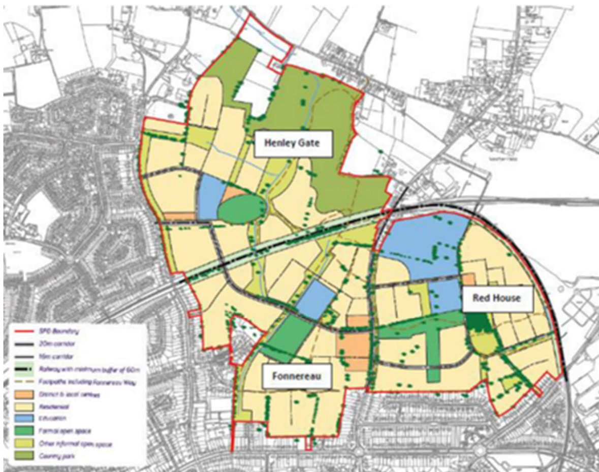
Figure 2 - Map from Ipswich Borough Council's Ipswich Garden Suburb Delivery page, www.ipswich.gov.uk/content/ipswich-garden-suburb-delivery .