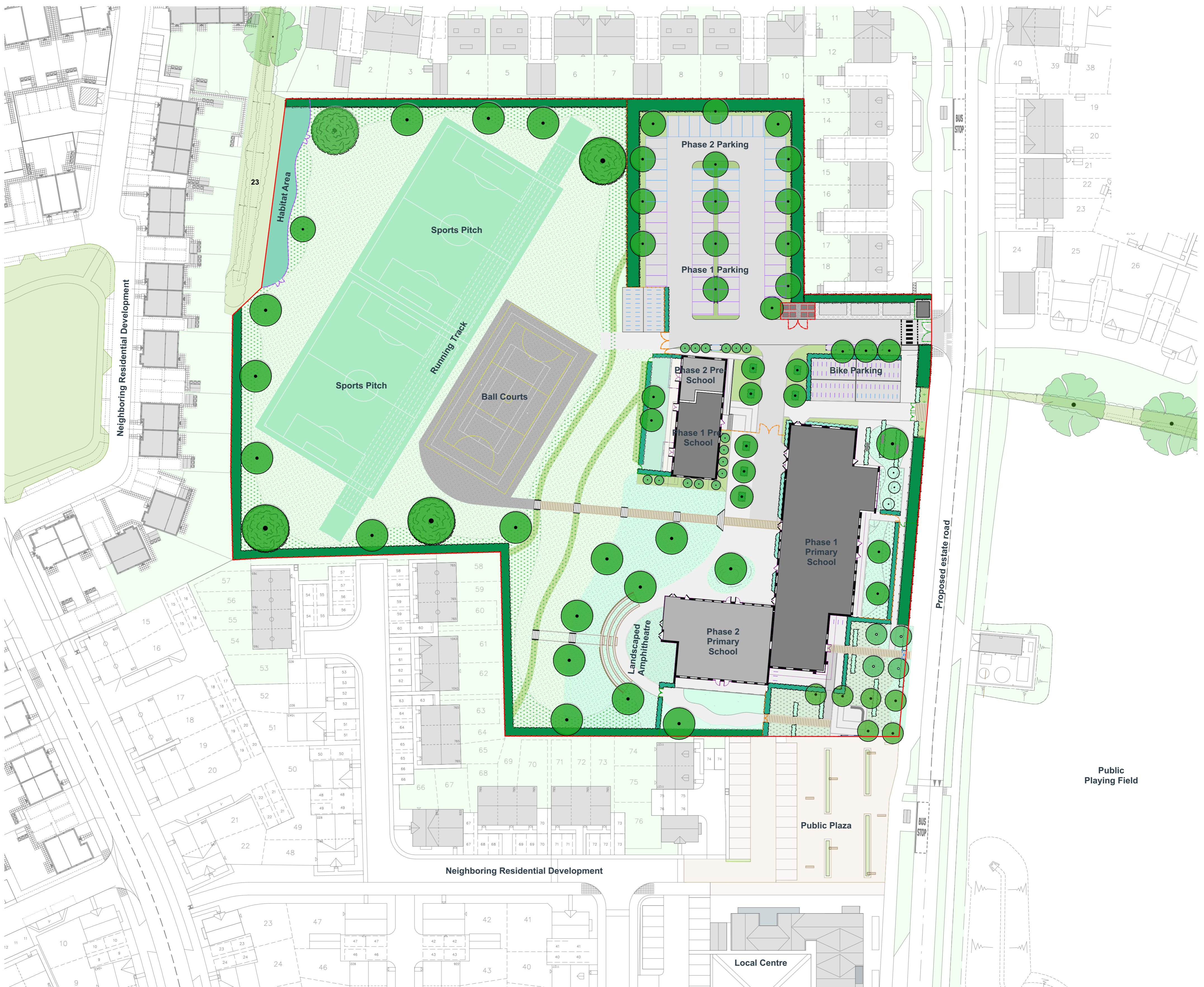
Site Key Plan | 1:500 @ A1