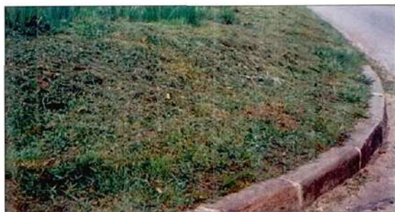
Granite kerbs protecting a vulnerable corner