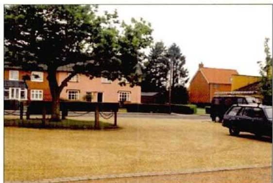
This double dressing at The Square in Dennington has worn well