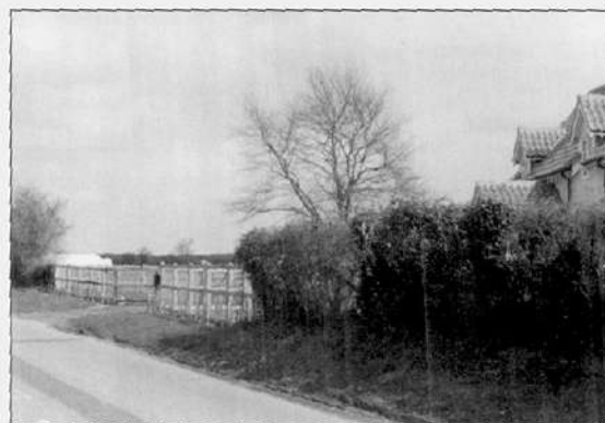
A new access with temporary post and rail fence alongside a replacement hedge

match the existing road surface to give a simple, seamless solution. Agricultural accesses which have a hard surface are traditionally concrete and this is often more appropriate than blacktop. Accesses should visually relate to any private part of the access as well as the public highway. A gravel aggregate finish may be an appropriate solution but concrete block paving is not traditional and, in most cases, inappropriate in the countryside.