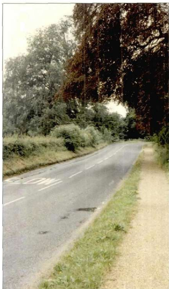
Above and right: the grass strip retains the rural character in these two examples