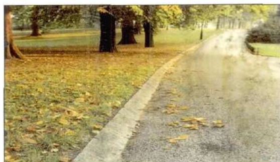
Kerbs laid on a batter so that soil can be mounded over the top (where overrunning is a problem the kerb can be laid at a steeper angle)