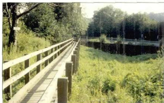
A timber footway neatly solves a local safety problem at Holbrook