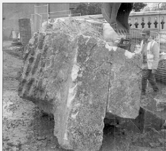
Archaeological excavations at Ballingdon Bridge discovered remnants of previous bridges