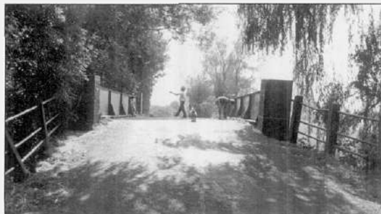
The replacement for this bridge at Jude's Ferry needed planning permission as it did not abut the existing highway