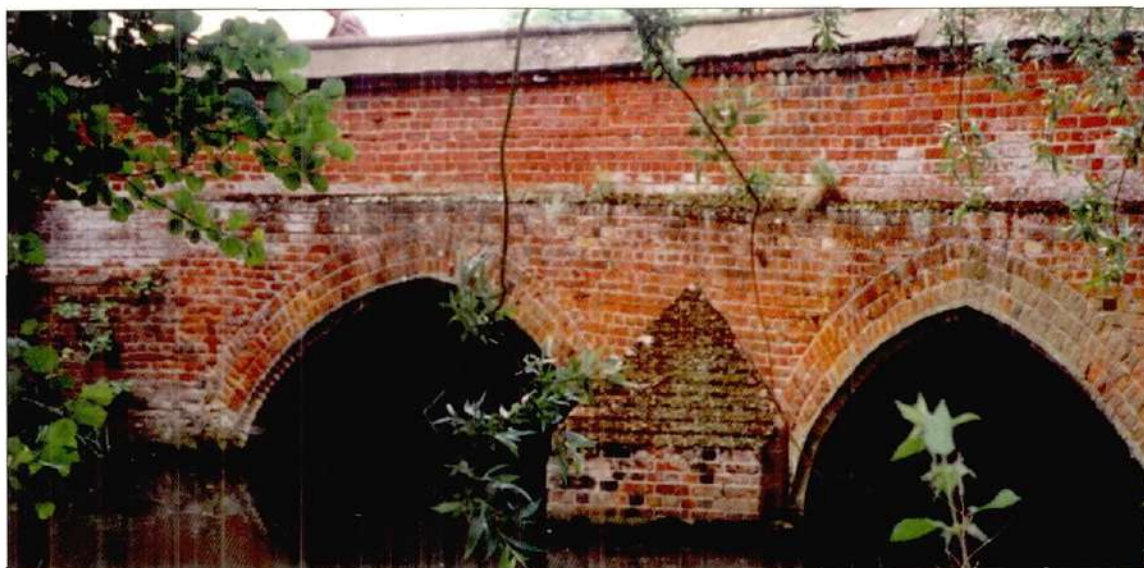
Careful repair of Toppesfield Bridge in Hadleigh, a Grade II* listed structure and Scheduled Ancient Monument