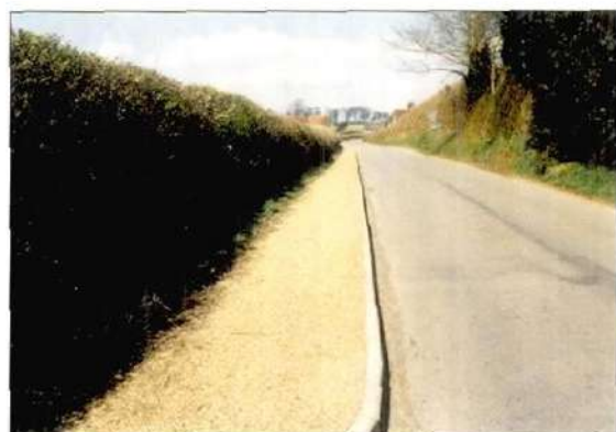
A new surface dressed footway at Marlesford

Safety is of paramount importance when creating a new access but care should also be taken to ensure that it blends well into the existing street scene. As such, both the Highway Authority and the Suffolk planning authorities have resolved to apply a balanced approach to width, visibility splays and the application of other standards in rural areas.