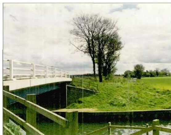
The site of the demolished Jude's Ferry bridge was returned to its natural state