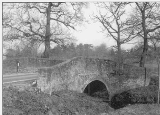
This Grade II listed bridge at Bealings is also a Scheduled Ancient Monument