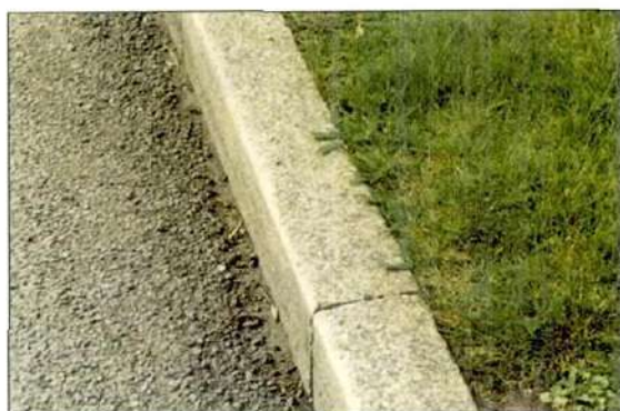
Exposed aggregate concrete kerbs