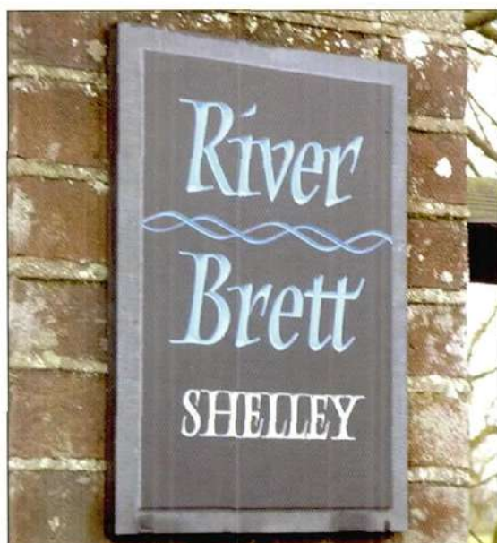
Plaques provided by the Dedham Vale Project add local distinctiveness to bridges in the Stour Valley