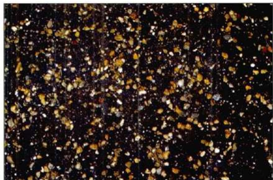
Gravel based wearing course with pre-coated stones rolled in