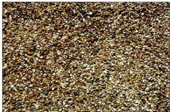
Surface dressing with clear binder