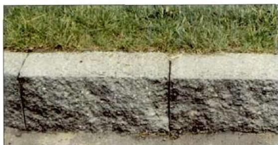
Riven concrete kerbs