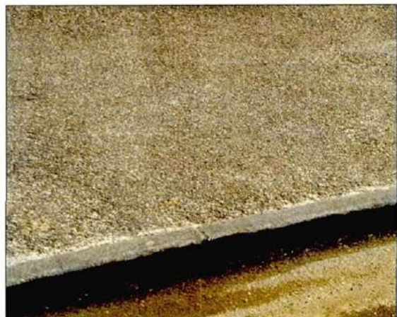
Different coloured aggregates can be used on footways and carriageways