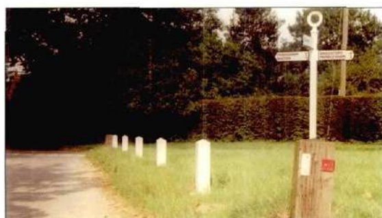
Posts protecting the edge of a village green are an alternative to kerbs