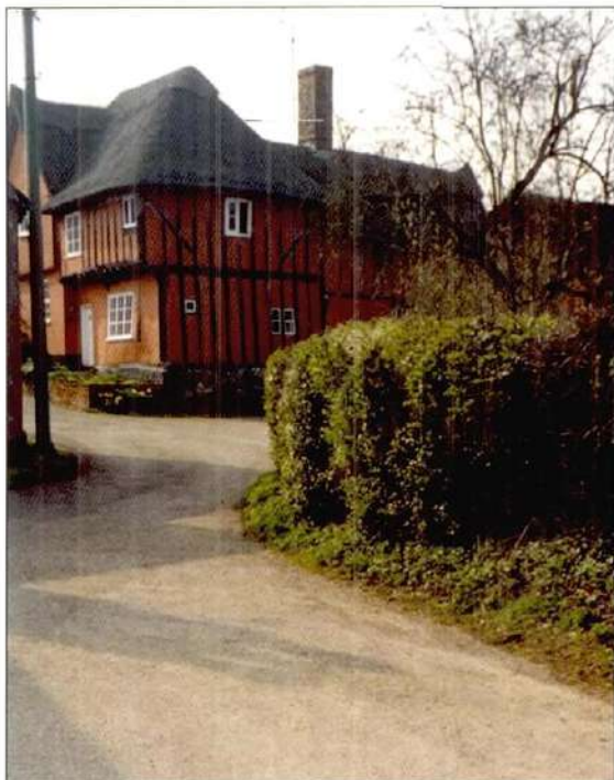
This light coloured surface at Kersey complements the rural character

Further advice on the use of surface dressing can be found in The Surface Dressing Manual: A Good Practice Guide for Surface Dressing in Enhancement Work.