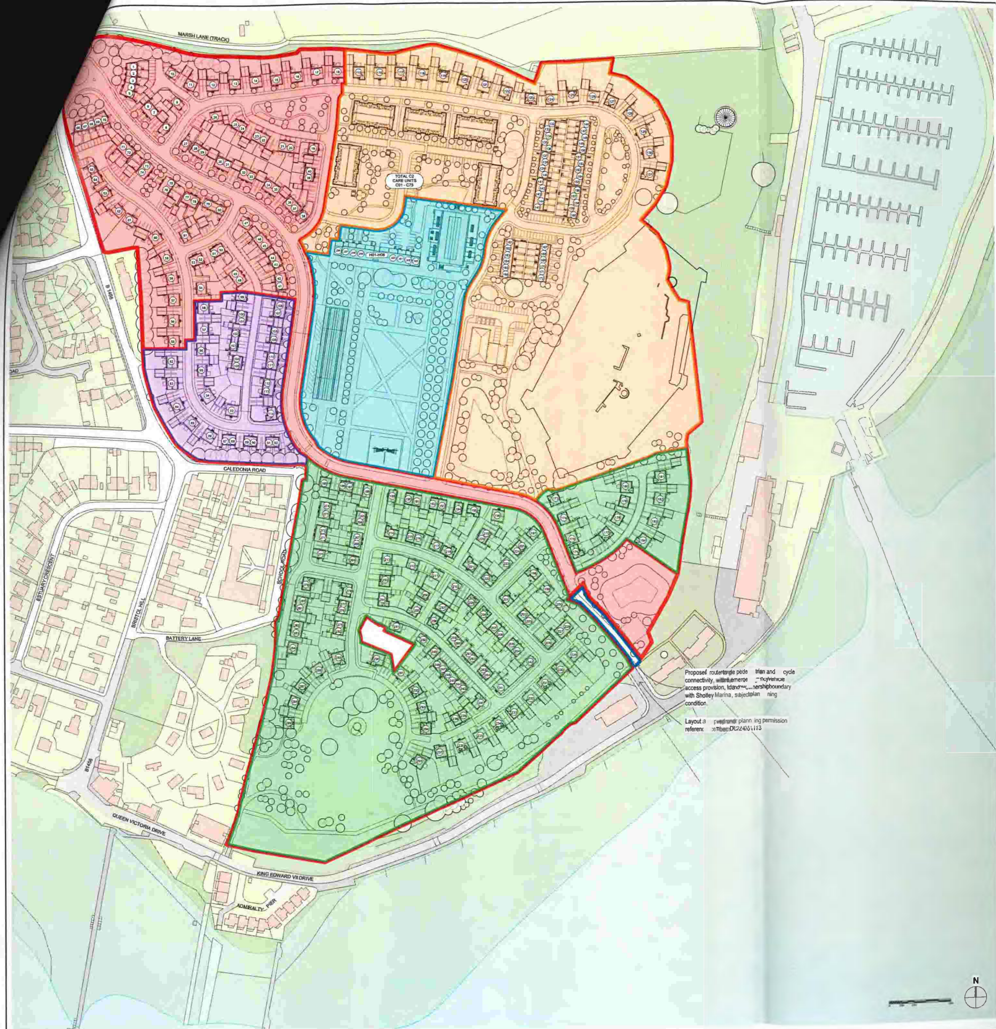
1 Proposed Overall Site Phasing Plan 1 : 1500