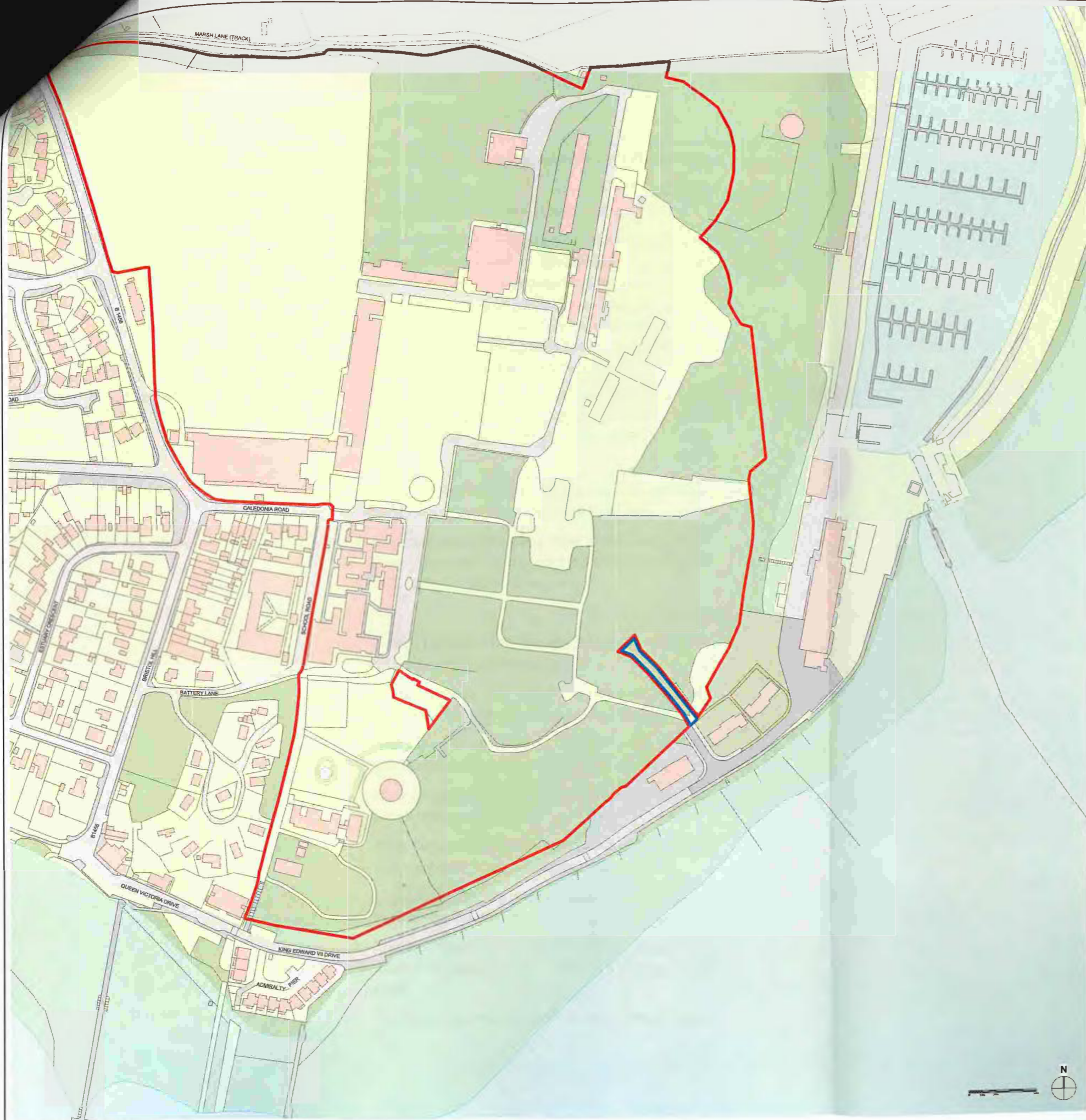
1 Site Plan - Plan 1 1:1500

GENERAL NOTES 1. Do not scale off this drawing unless a scale bar is provided 2. Any ambiguities, omissions and errors on this drawing should be notified immediately to the Architect before the commencement of works on site 3. Dimensions are in millimetres unless otherwise stated 4. Dimensions, unless otherwise indicated, are to the face of unfinished block walls or to the finished plaster face of stud partitions 5. Dimensions are to be checked on site. Discrepancies are to be notified immediately to the Architect before the commencement of works on site 6. All levels are in meters unless otherwise stated 7. This drawing is to be read in conjunction with all other relevant drawings and specifications for this project