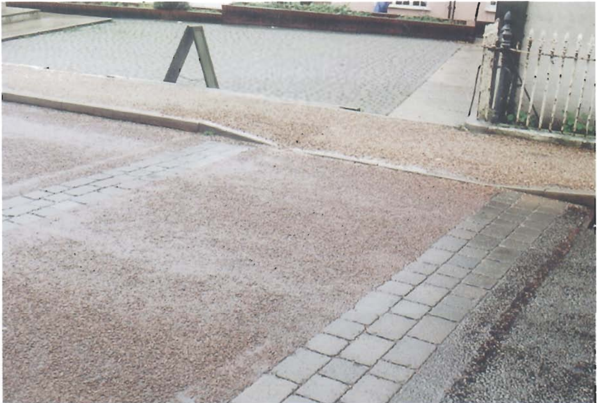
Contrasting aggregates were used for safety reasons for the footways and carriageway calming features at Rickingham - Botesdale.