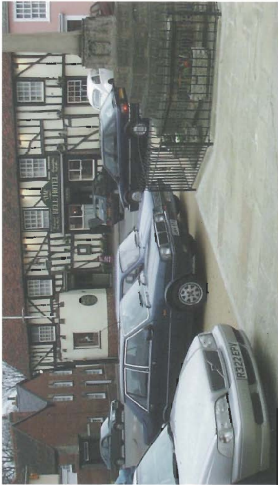
(Market Hill - Clare)