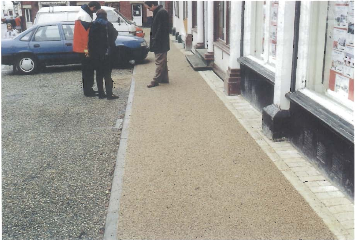
(Above and below) Different binders were used in this scheme at Eye for car parking areas and footways. The modified bituminous binder on the car park has not worn as well as the high quality resin footway binder.