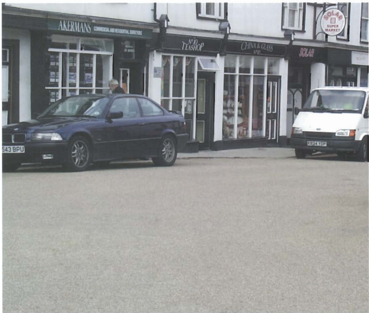
At Framlingham three different coloured aggregates were blended to get the desired effect.