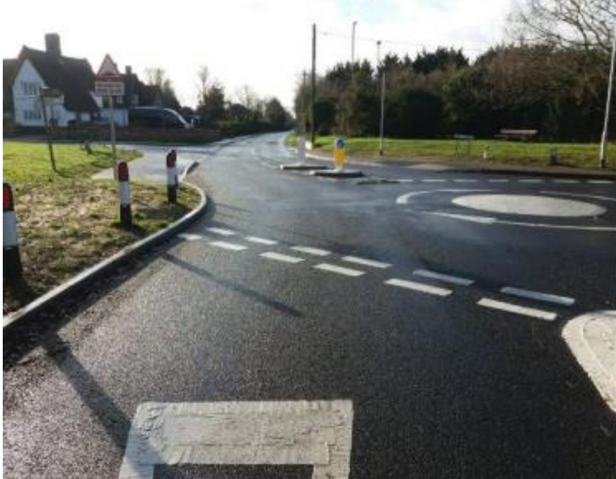
Rushmere St Andrew, East Suffolk - Playford Road Traffic Calming

The project consists of a mini roundabout, speed humps and new street lighting units at the roundabout. The project was completed during summer 2022.