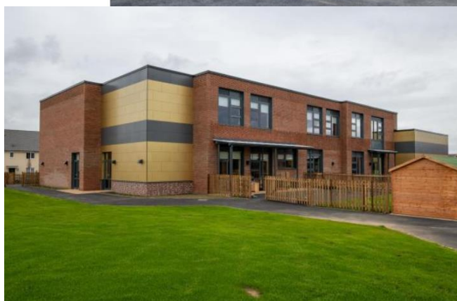
Grace Cook Primary School and Pre School, Stowmarket, Mid Suffolk

The total cost of the new primary school and pre-school was £6,080,116 of which £5,898,869 was secured through s106 developer contributions.