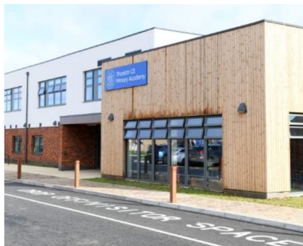
Thurston Primary School, Thurston, Mid Suffolk Completed in August 2021

This statement also provides information on infrastructure projects delivered by SCC.