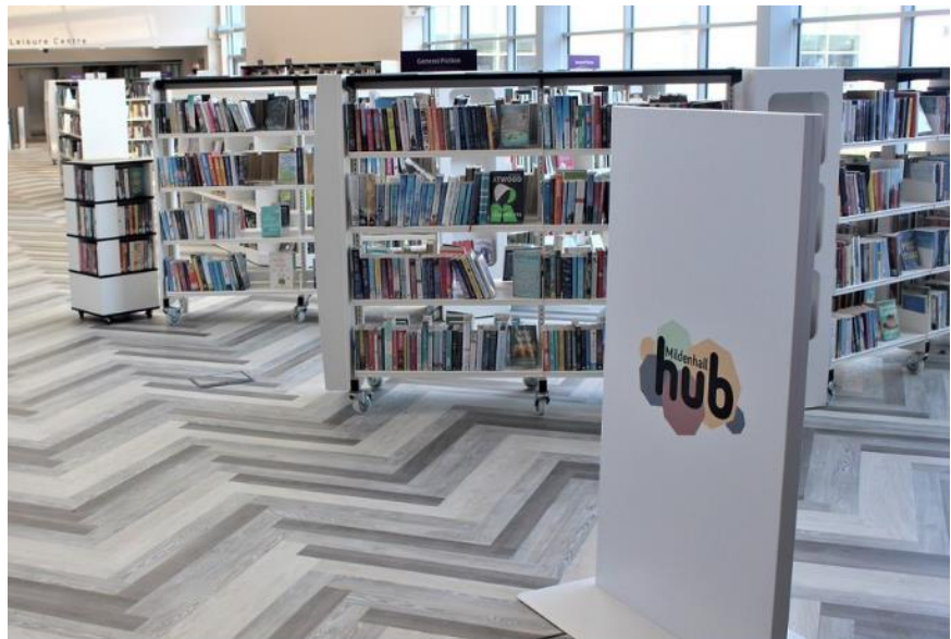
Mildenhall Library, Mildenhall Hub, West Suffolk