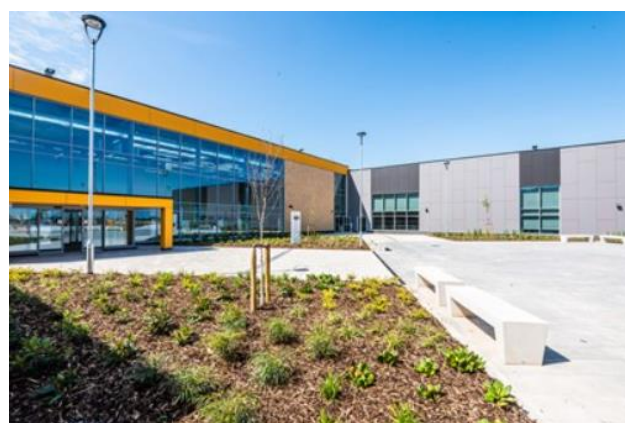
Mildenhall Hub, Mildenhall, West Suffolk Completed in June 2021