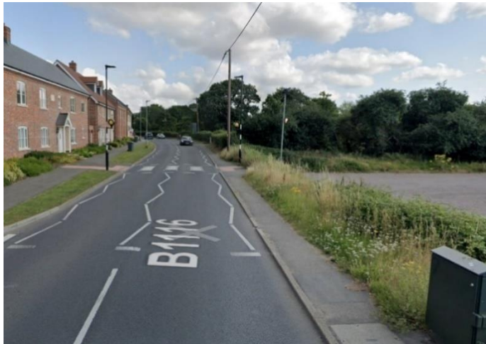
Framlingham, East Suffolk - Walkways route

The first part of the projects was delivered in November 2018 and included a new zebra crossing on Station Road (photo to the left), adjacent to the Hopkins Homes site known as Prospect Place. The total cost of this phase of the project was £39,908.