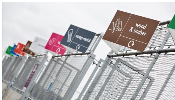
Example of a Recycling Centre

The new design will provide queuing capacity within the site and improved access from the public highway. The raised level construction will improve access to the containers for site users by removing the need for stairs. It means containers can continue to be emptied without the need to close the site.