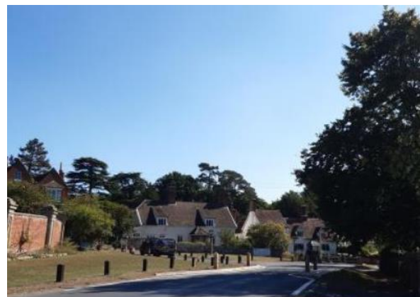
Easton, East Suffolk – Traffic calming measures