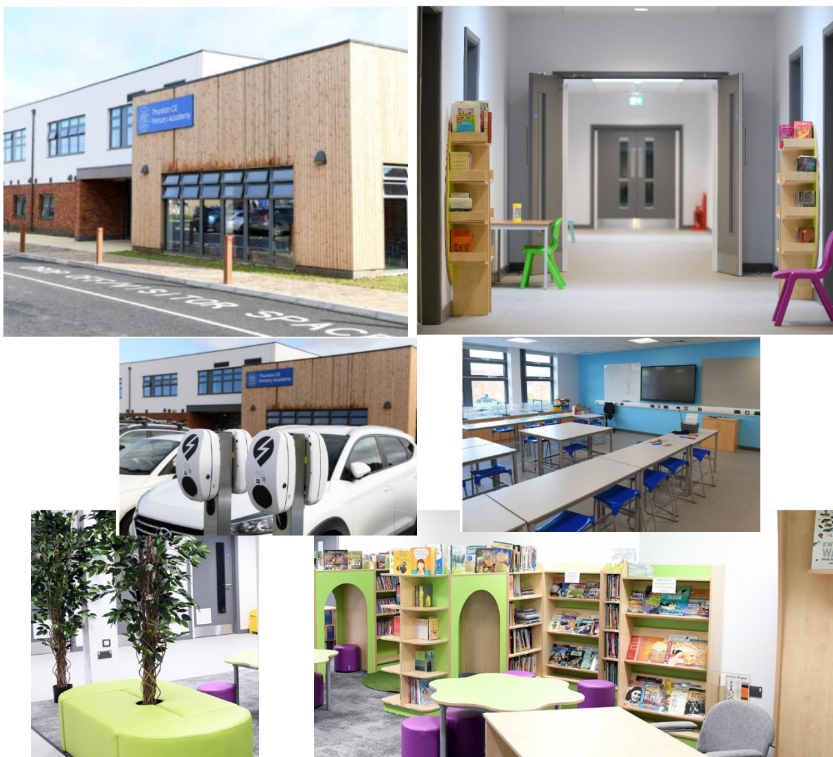
Thurston Church of England Primary Academy and Pre-school, Mid Suffolk

The total cost of the new primary school and pre-school was £7,602,922 of which £4,243,535 was secured through s106 developer contributions.