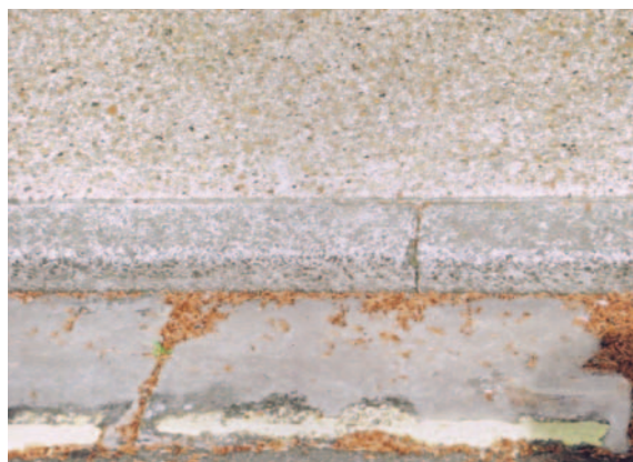
Old concrete kerbs