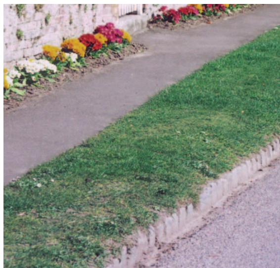
In Easton a simple blacktop footway is enhanced by the grass verge and granite setts forming the kerb

In some rural or village environments black top can be appropriate however given its low key nature.