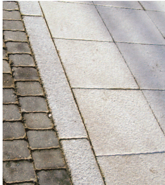
Flush exposed aggregate concrete kerbs in Lowestoft