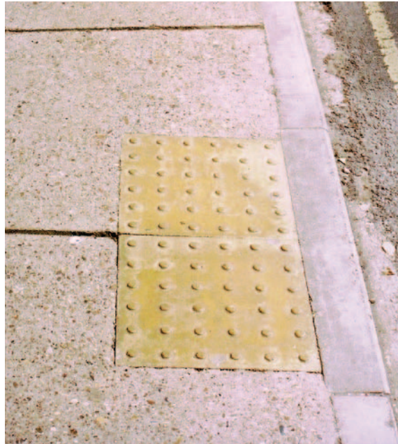
A small area of buff tactile laid in a narrow footway

The colour of tactile paving is also used to denote different meanings to the partially sighted, normally red at controlled crossing points, buff at uncontrolled.