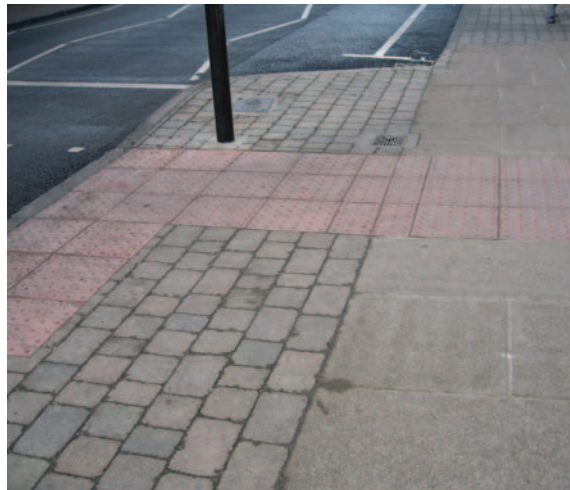
In this scheme at Needham Market pink tactile paving was selected as it related to the chosen palette of materials