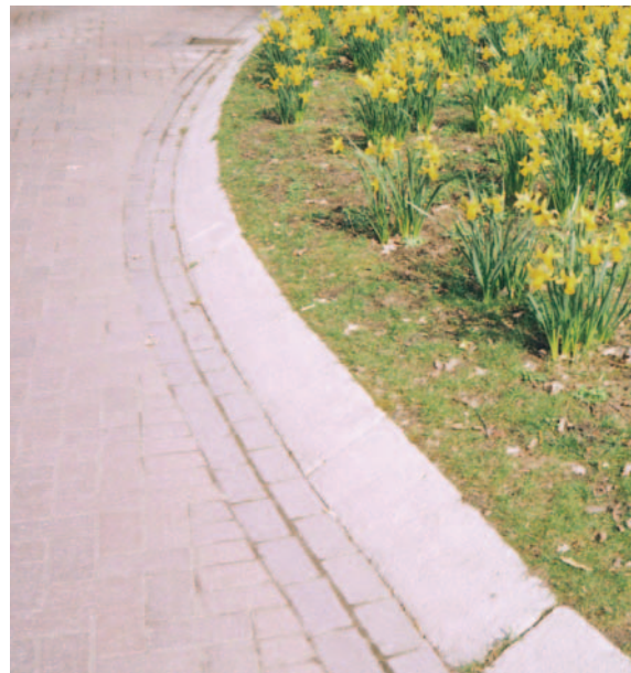
Kerbs laid on a batter so that soil can be laid over the top (where over running is a problem the kerb can be laid at a steeper angle)