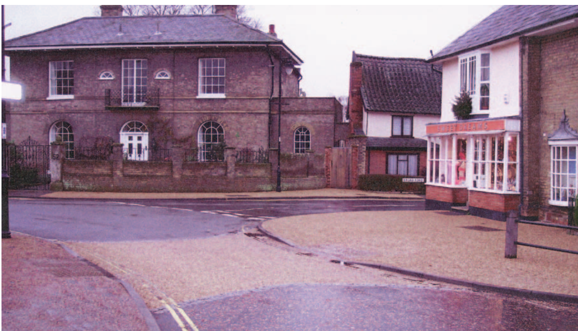
A mix of surface dressing and wearing course with exposed gravel aggregate was used in order to improve the space for pedestrians at The Hill, Wickham Market