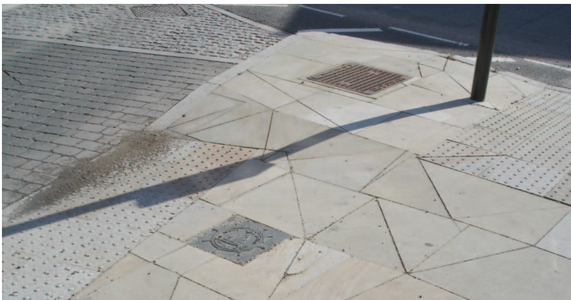
Changes in levels at crossing points can have a significant impact on the laying pattern of materials