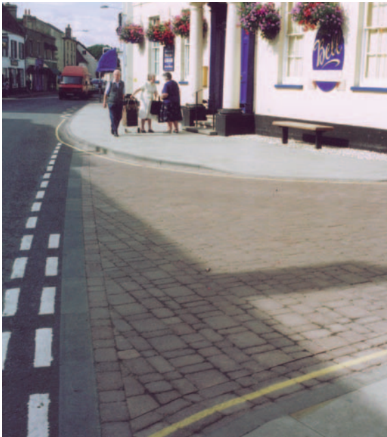
New granite kerbs and channel laid in the High Street, Saxmundham

Kerbs may also be laid flush to an area to demarcate an edge or contain an area of surface dressing. If flush kerbs are likely to be overrun by vehicles, careful laying is needed to avoid movement.