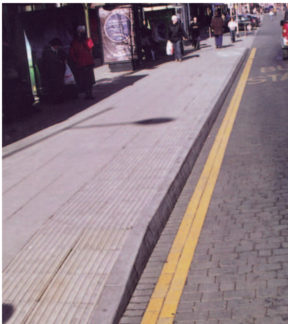
Corduroy tactile paving at a bus stop in Lowestoft