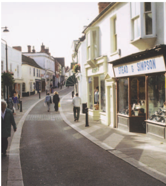
New granite kerbs reinforce the historic character of The Thoroughfare in Woodbridge