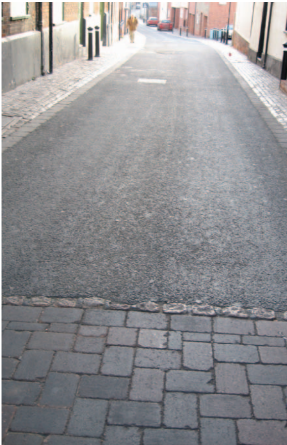
The use of blacktop can be appropriate in many locations but it can emphasise the dominance of motor vehicles

Extensive use of bituminous surfacing for both footways and carriageway, in busy areas such as town centres, can create a lack of contrast between the two. This can cause conflict between pedestrians and vehicles. In order to improve these areas other materials should be considered for use alongside black top to give clear messages to the highway users.