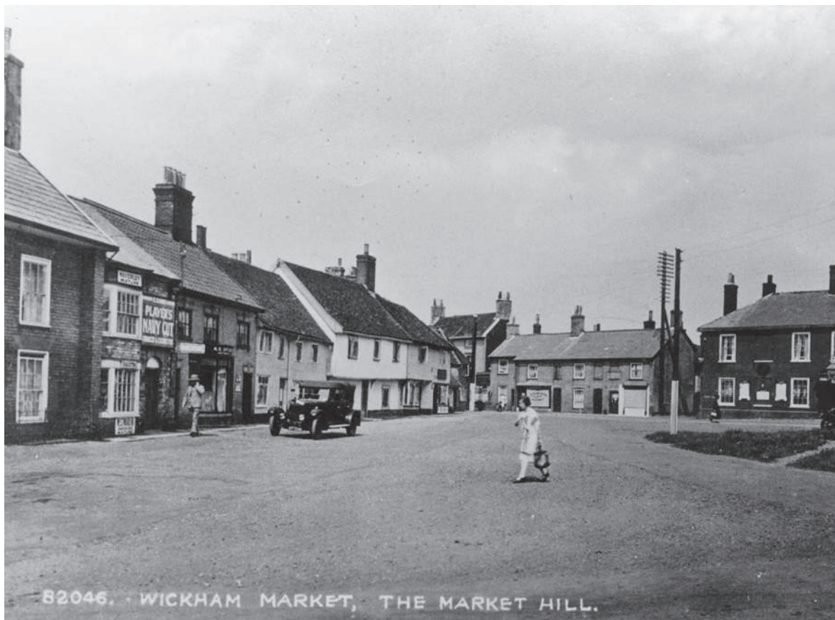
Historic photographs illustrate the simplicity of surface treatments as shown here in Wickham Market

In general, the majority of surfacing on roads is machine laid. Contractors will charge by the weight of materials or the area to be laid. Materials laid by hand should be avoided and only considered on footways and areas of road inaccessible by a machine. Hand laying large areas can produce a varying degree of surface irregularities. Laying small areas on either road or footways will be more expensive when compared to larger areas because of the set up costs of equipment, transport and labour.