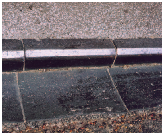
Blue clay kerbs and channels