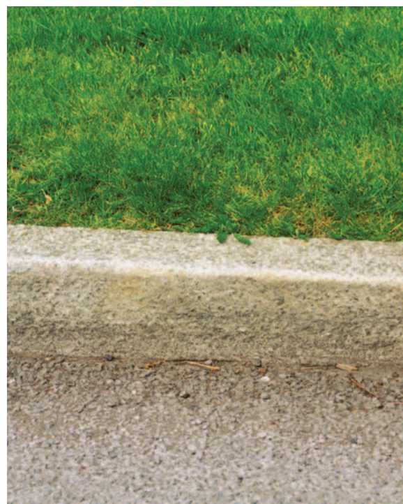
Exposed aggregate concrete