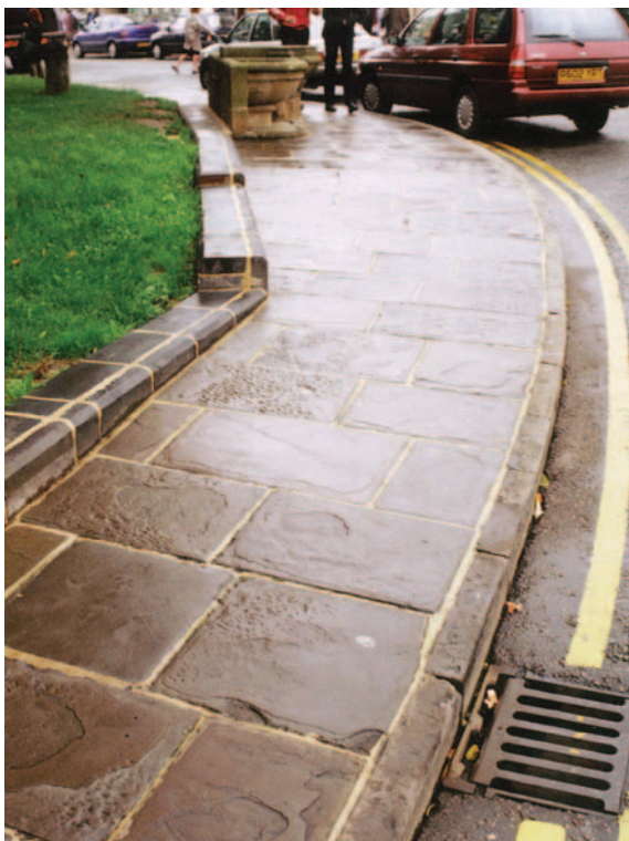
Historically, granite kerbs were used with riven Yorkstone flags (Sudbury)

Even second hand modern concrete kerbs have a more weathered look and can help soften the impact of kerbing in comparison with new smooth concrete.