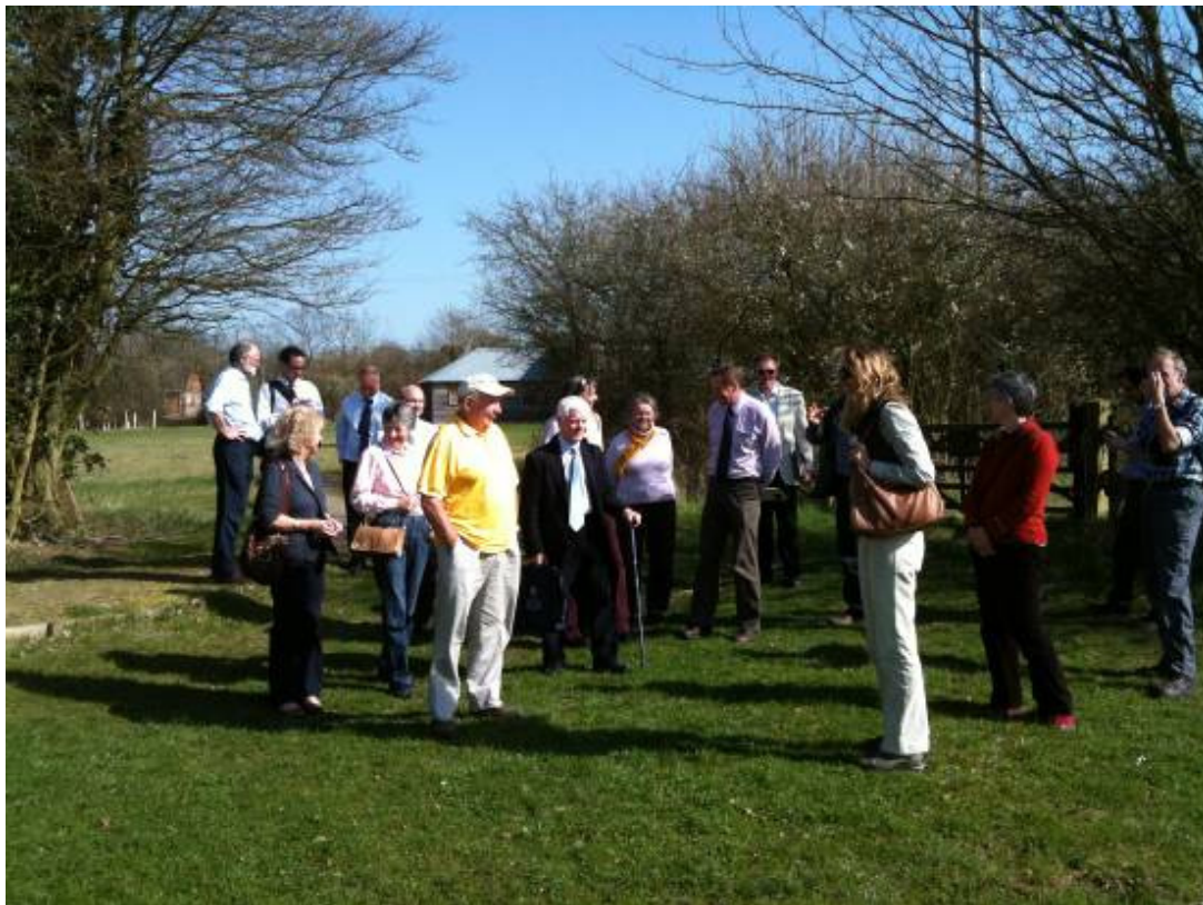
The IPF and invitees at the Green Light Trust woodland area, Lawshall, Suffolk.