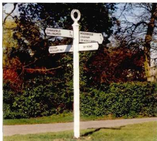
Provision of enhanced fingerposts: Pettistree