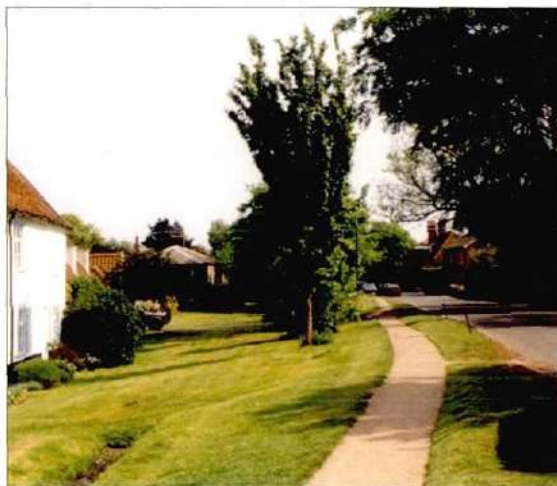
New footway: Orford