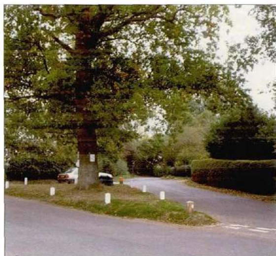
Village green protection: Thorndon