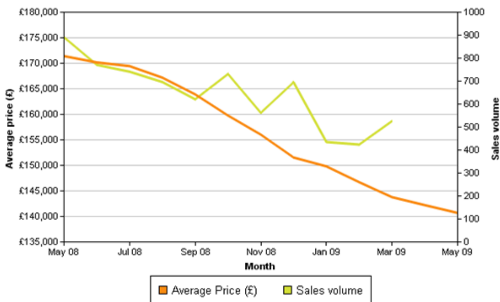
House price and sales volume - Suffolk