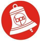
Bacton Primary School