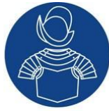
Mendlesham Primary School